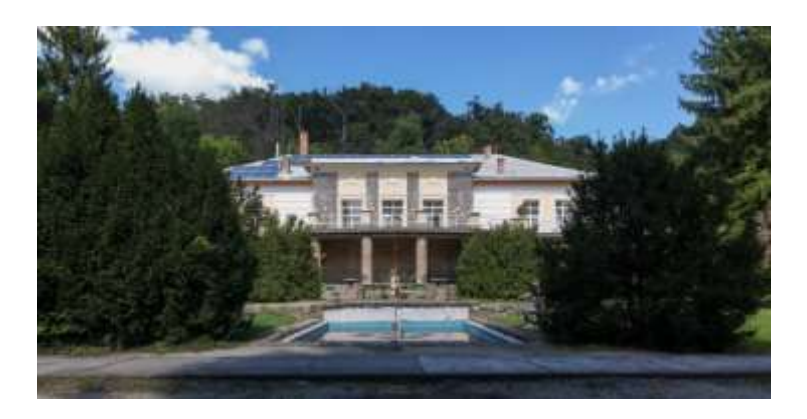
NATURE AND TRADITION IN HEALING

The beauty of the landscape, the beneficial microclimate of the area, the medicinal waters suitable for both internal and external use as well as the medicinal mofette gas maths all make Parádfürdő a nationally and internationally renowed health resort.